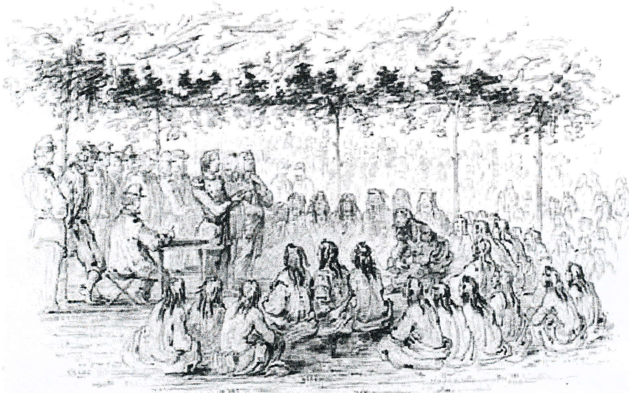
Council with friendly Nez Perces Indians held by Col. G. Wright Dec. 1855 near Fort Walla Walla. Walla W. to previous to march against hostile northern Indians.