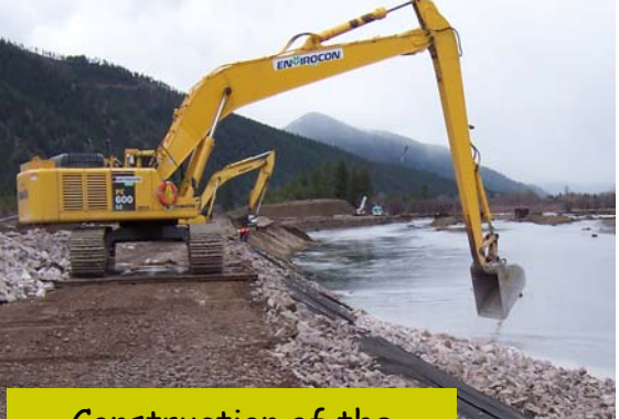
Construction of the Clark Fork "Launch" Pad