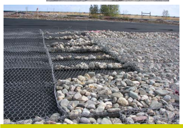
Wire cages filled with rock to form base of the reno mattress; a wire cover is then added to complete the mattress and line the Clark Fork River bypass channel.