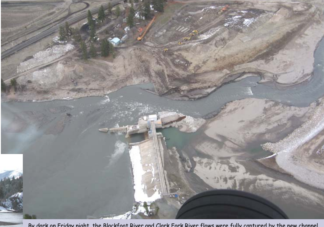
By dark on Friday night, the Blackfoot River and Clark Fork River flows were fully captured by the new channel. This photo, taken by Gary and Judy Matson of West Riverside on Sunday, March 30, 2008, shows the newly incised channel. Both the Blackfoot and Clark Fork Rivers are flowing through the gap in the dam created by the removal of the Powerhouse and right abutment.

Notice the dry reservoir sediments and the old Clark Fork River channel in the lower right of this photo. Another earthen berm will be built to keep these sediments from eroding during spring high flows and create a dry work area for removal of the rest of the Milltown Dam. Removal of the divider block, radial gate, and spillway is set to begin later this summer and take several months to complete.