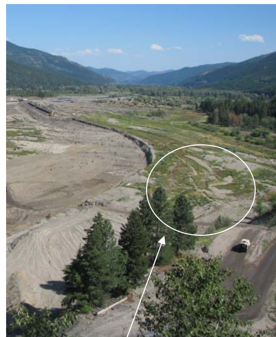
Approximate location of the Area IIIb sediments. Discussions progress regarding removal of these sediments (about 230,000 yd 3 ). If an agreement is reached, these could be removed later this year.

For more information, contact Montana FWP at 542-5500.