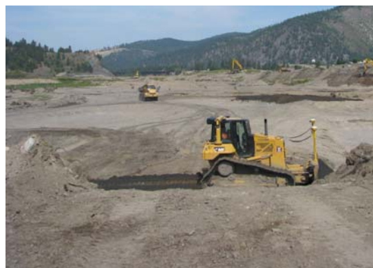
Placing growth media (soils that will help establish floodplain vegetation), 8/18/09.