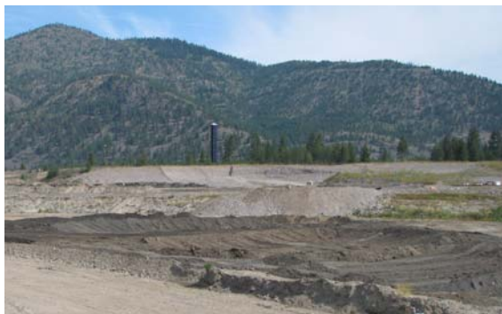
Growth media placed on wetlands and swales for base of future river restoration work—an area previously filled with contaminated sediments. Photo 8/18/09.