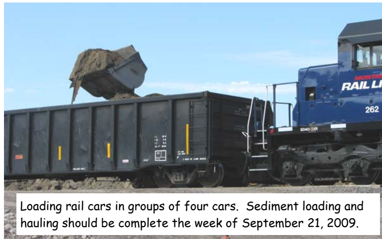
Loading rail cars in groups of four cars. Sediment loading and hauling should be complete the week of September 21, 2009.