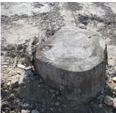
Above: Close up photo of one of the stumps unearthed during sediment excavation.