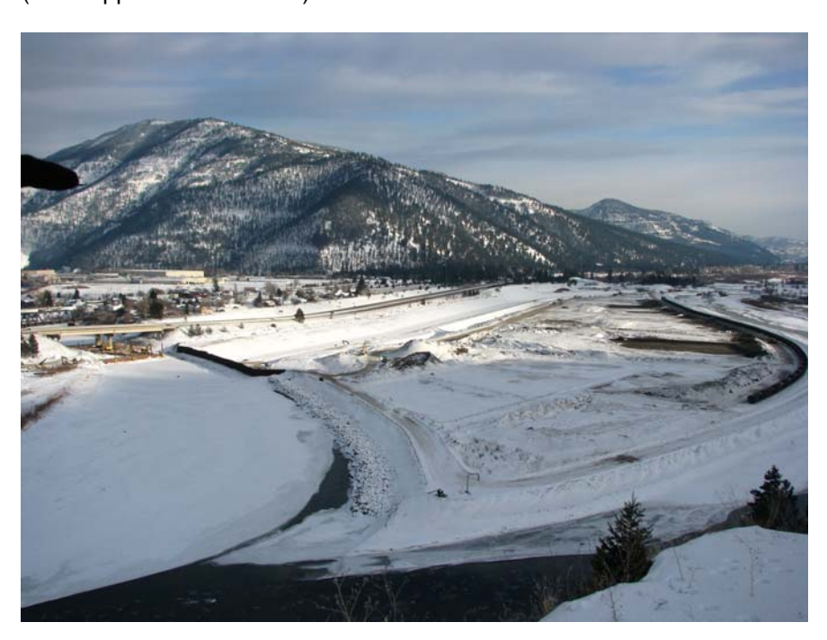
Here is a photo of the Milltown Dam and Powerhouse, 1/22/08:

Here is a photo looking at the site from January 20, 2008. Notice that the Clark Fork River has not yet been diverted into the Bypass Channel (that happened on 3/18/08).